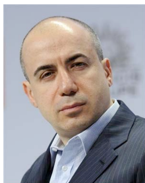
FROM RUSSIA WITH LIKE- When Digital Sky Technologies Chief Executive Yuri Milner invested $200 million in 2009, it gave Facebook a $10 billion valuation.

Holy cow, Facebook's worth $10 billion? That may be how the social networking website would like the world to interpret its latest capital infusion. But don't be fooled. While that may represent a target valuation for Facebook, the actual worth, today, of Mark Zuckerberg's dorm-room creation may be much lower.