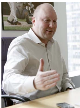
MISSING THE MARC - Netscape founder Marc Andreessen invested in a social networking company called Ning, but later became a director at Facebook.

There may be few second acts in American lives, but Marc Andreessen looks like he's about to embark on his third. His first company, Netscape, kick-started the dotcom era and eventually sold to AOL for $4.2 billion, although it was pummeled into irrelevance by Microsoft. His second effort, data centre software group Opsware, made less of a splash. But Hewlett-Packard just agreed to buy it for a respectable $1.7 billion. It's unclear whether his third effort, social networking group Ning, will succeed. But while entering an established business line is a new approach for Andreessen, there's a chance he'll once again radically change the game.