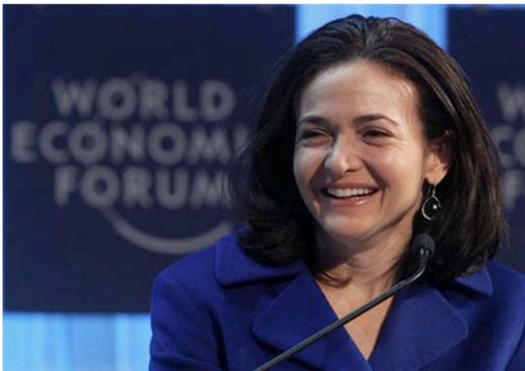
HELPING HAND – Sheryl Sandberg joined Facebook as chief operating officer from the U.S. Treasury Department in March 2008, shortly before reports surfaced that the company was trying to buy Twitter.