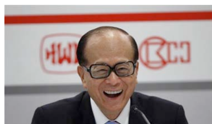
WHY IS THIS MAN SMILING? - Hong Kong tycoon Li Ka-shing was an early-ish investor, who bought in to Facebook at a $15 billion valuation.

So while $10 billion could be a valuation Facebook and DST are aiming for, it may not reflect the company's real worth right now. But DST has also agreed to buy $100 million worth of shares held by Facebook employees.